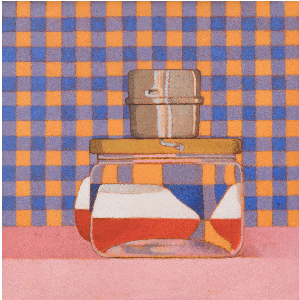
Viva Viva 2020, oil on panel 21.5 x 21.5 cm $1,450 (framed) SOLD