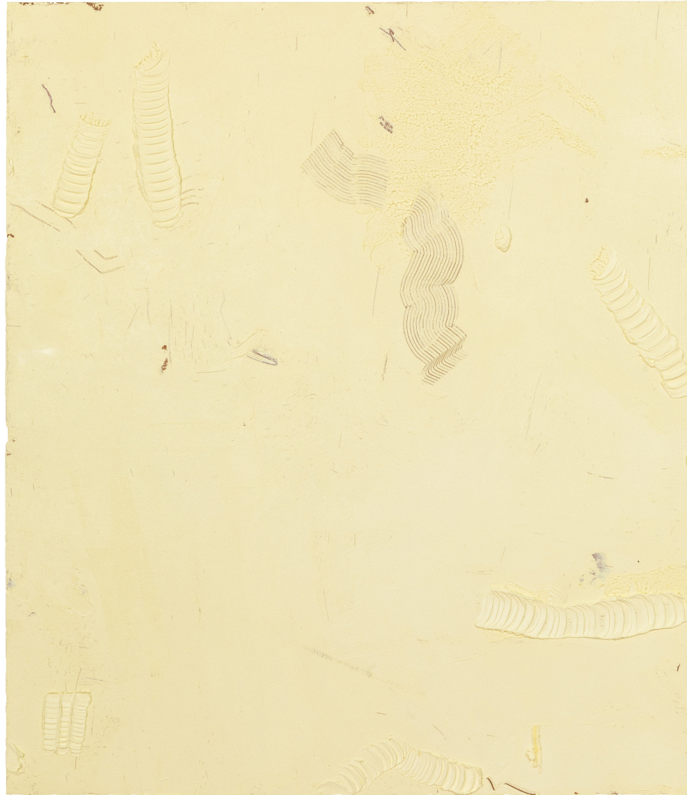
What Sales Cars 2020, oil and sand on board 110 x 95 cm $3,200