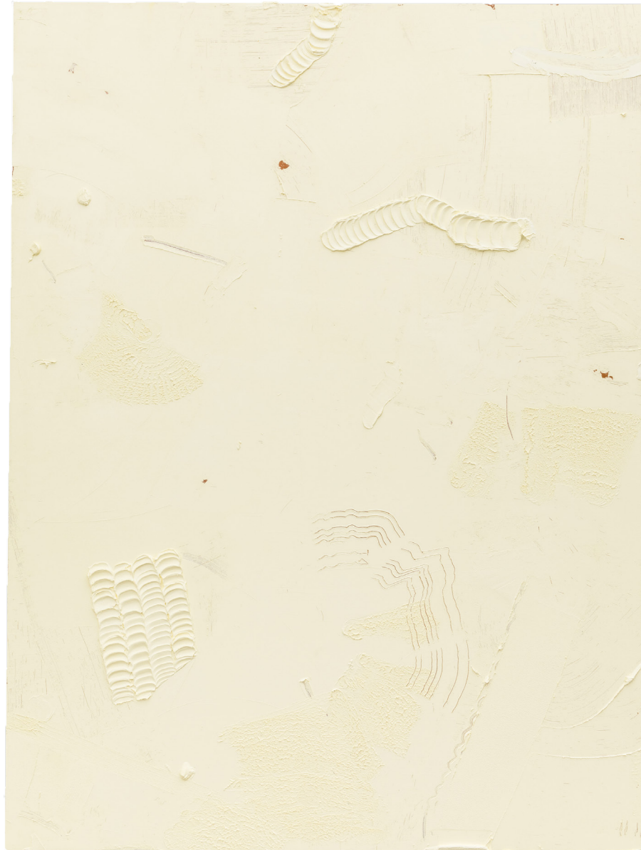
Pappa Does Sausages Grow On Trees I 2020, oil and sand on board 162 x 121 cm