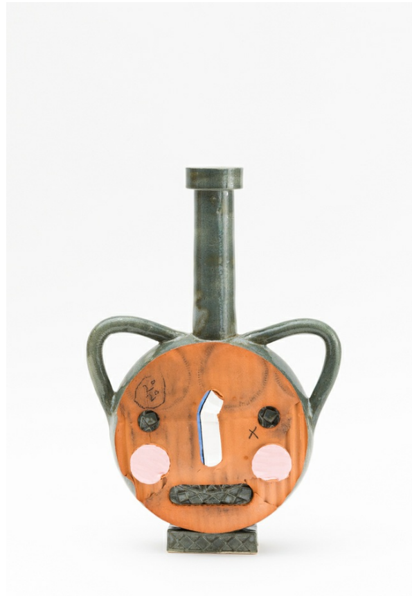
SCOTT DUNCAN Rosie, 2021 Earthenware, underglaze and glazes 39 x 26 x 8.5 cm AUD 1,650