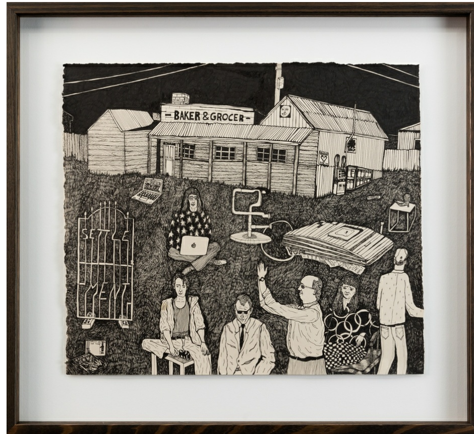
NICK SANTORO 1000 Mainys, 2021 Pen and ink on paper 38 x 43.5 cm Framed: 53 x 58.5 cm AUD 2,700