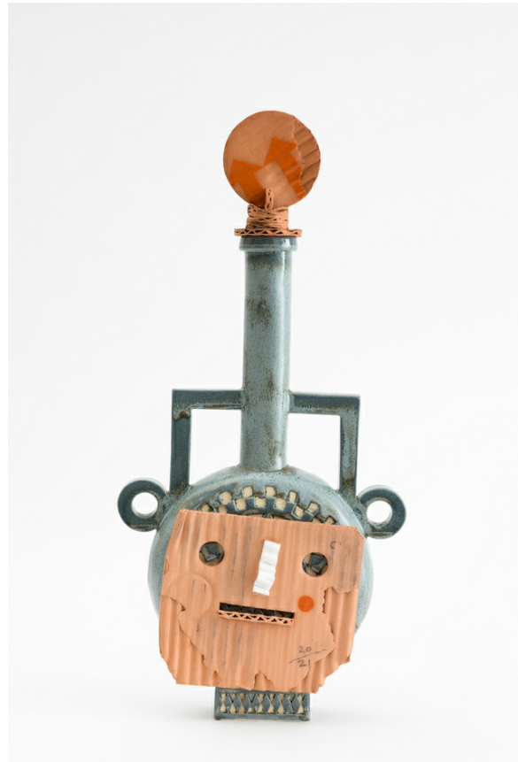
SCOTT DUNCAN Up and to the Left, 2021 Earthenware, underglaze and glazes 53.5 x 26 x 8.5 cm AUD 1,950