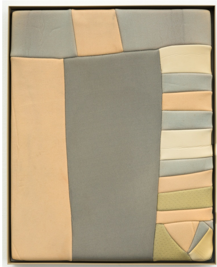
HENRY JOCK WALKER Yeezy Season Six, 2021 stretched found neoprene with powder-coated steel frame 52 x 42 cm AUD 1,800