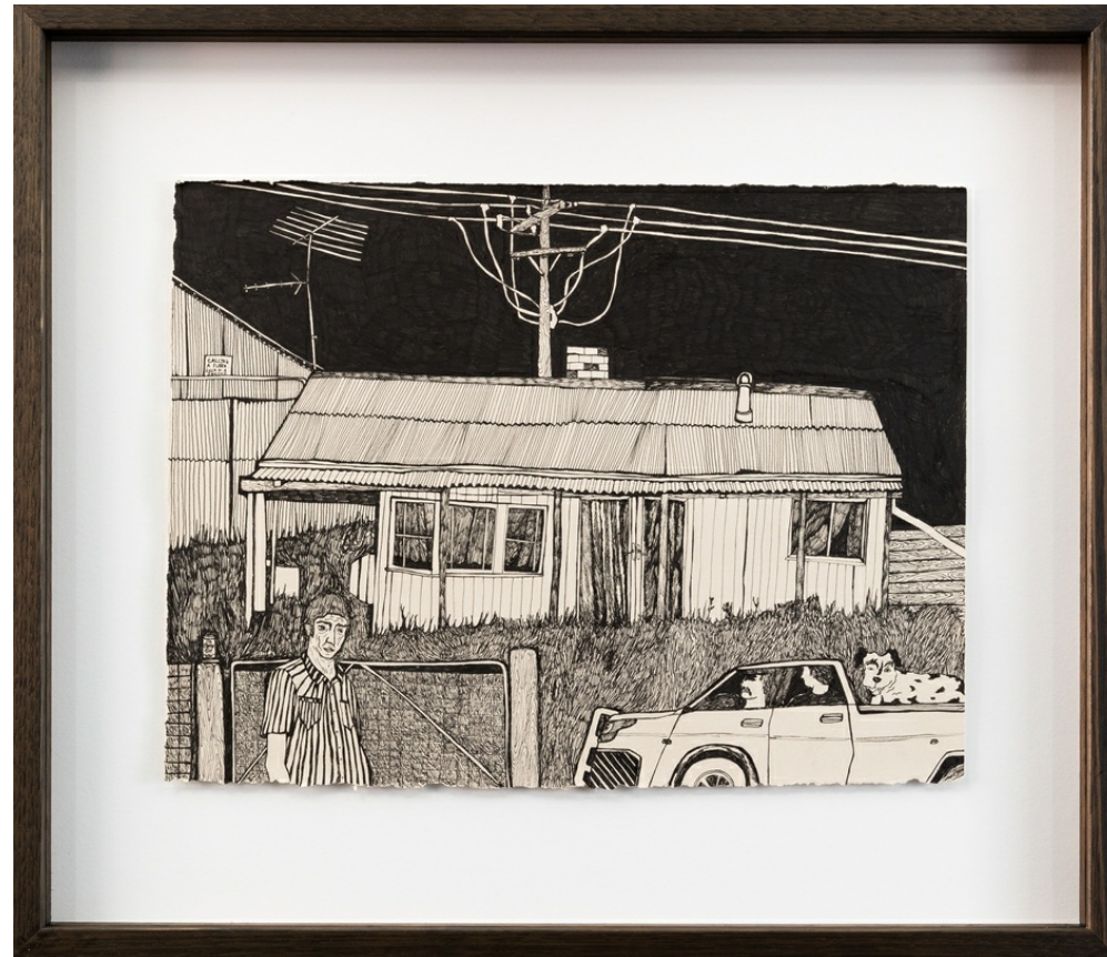
NICK SANTORO Lees Lane, 2021 Pen and ink on paper 28 x 37 cm Framed: 45 x 52.5 cm AUD 2,400