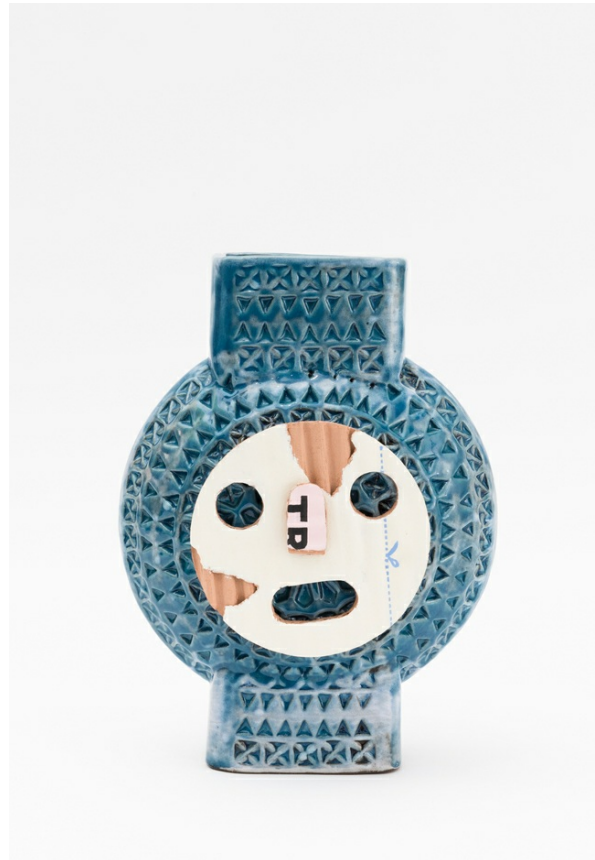
SCOTT DUNCAN Little Bluey, 2021 Earthenware, underglaze and glazes 25.5 x 20 x 10.5 cm AUD 1,250