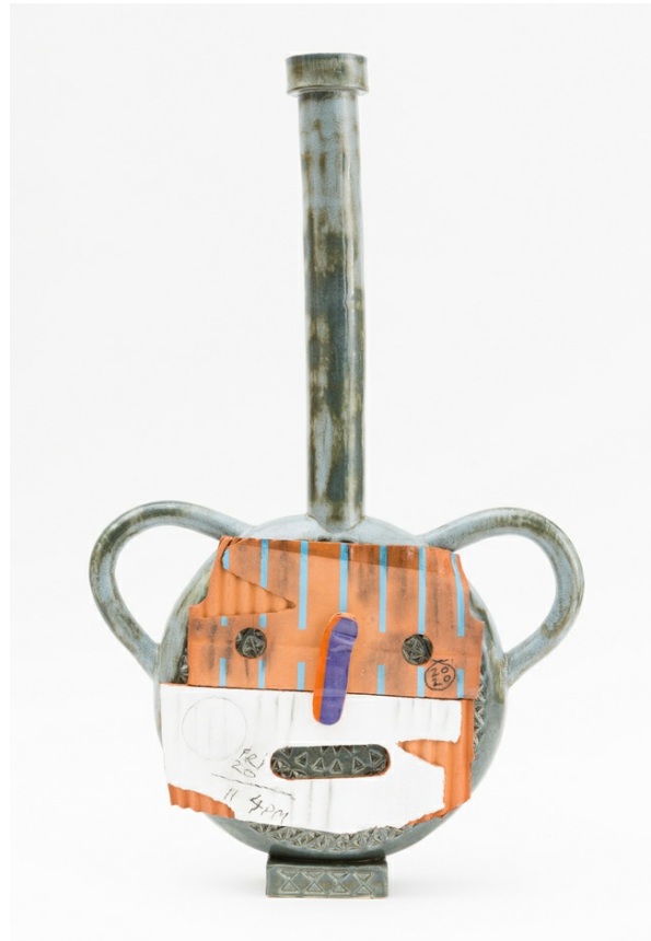
SCOTT DUNCAN Longneck, 2021 Earthenware, underglaze and glazes 59.5 x 36 x 8 cm AUD 1,950