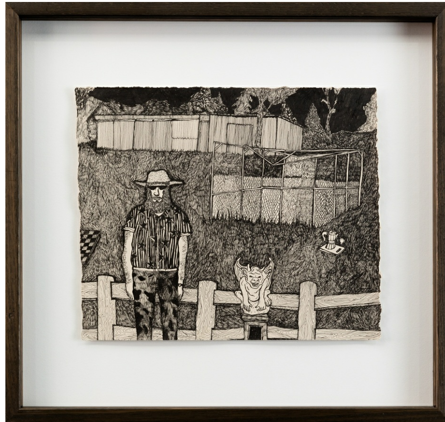
NICK SANTORO The Legend of..., 2021 Pen and ink on paper 24 x 28.5 cm Framed: 41 x 43 cm AUD 2,200