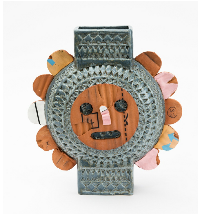
SCOTT DUNCAN Sun Deity, 2021 Earthenware, underglaze and glazes 27 x 29 x 12.5 cm AUD 1,650