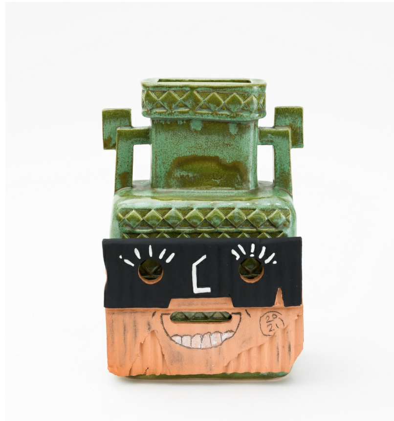
SCOTT DUNCAN Green Eyes, 2021 Earthenware, underglaze and glazes 27.5 x 18 x 12 cm AUD 1,650