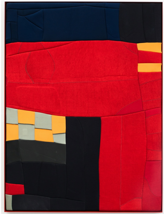
HENRY JOCK WALKER Racing Car Bunk Bed, 2021 stretched found neoprene with powder-coated steel frame 122 x 92 cm AUD 3,950