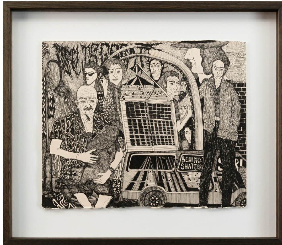
NICK SANTORO Life is Great, 2021 Pen and ink on paper 30.5 x 37 cm Framed: 45 x 52.5 cm AUD 2,400