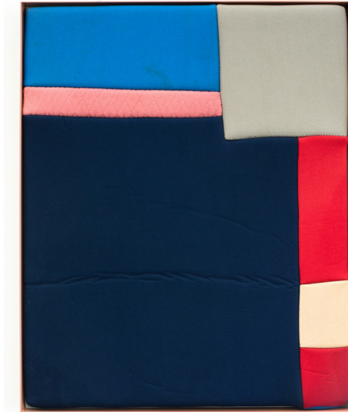
HENRY JOCK WALKER Golden Island Beach, 2021 stretched found neoprene with powder-coated steel frame 52 x 42 cm AUD 1,800