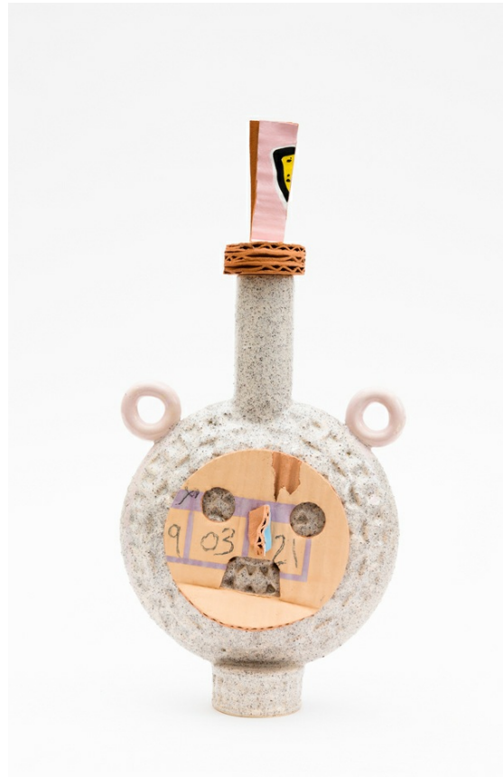
SCOTT DUNCAN Cookies n' Cream n' Bubblegum, 2021 Earthenware, underglaze and glazes 38.5 x 18.5 x 9.5 cm AUD 1,450