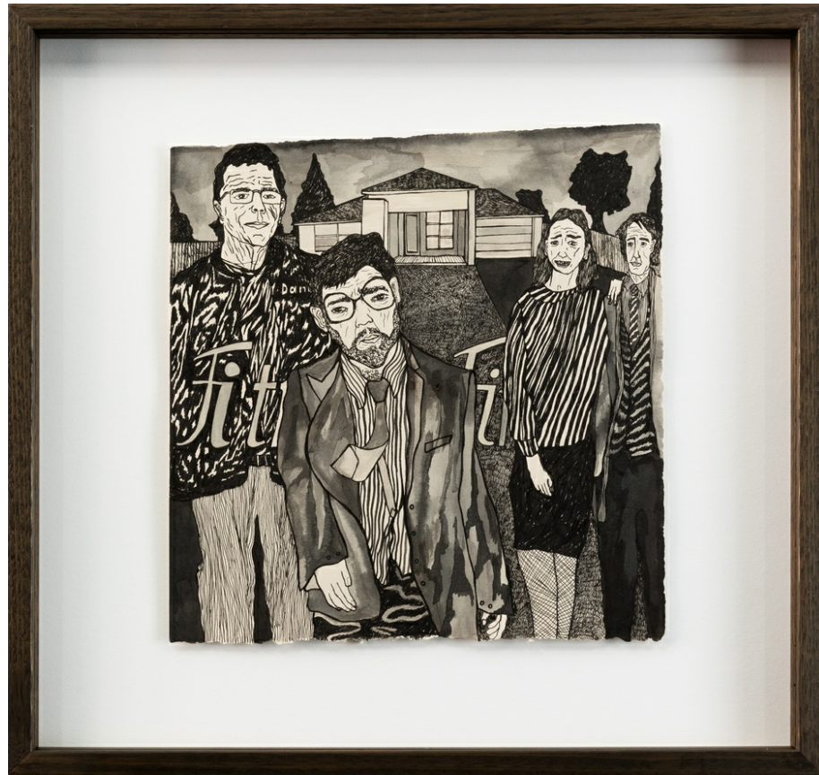
NICK SANTORO The Work is Never Done, 2021 Pen and ink on paper 25 x 26 cm Framed: 41 x 43 cm AUD 2,200