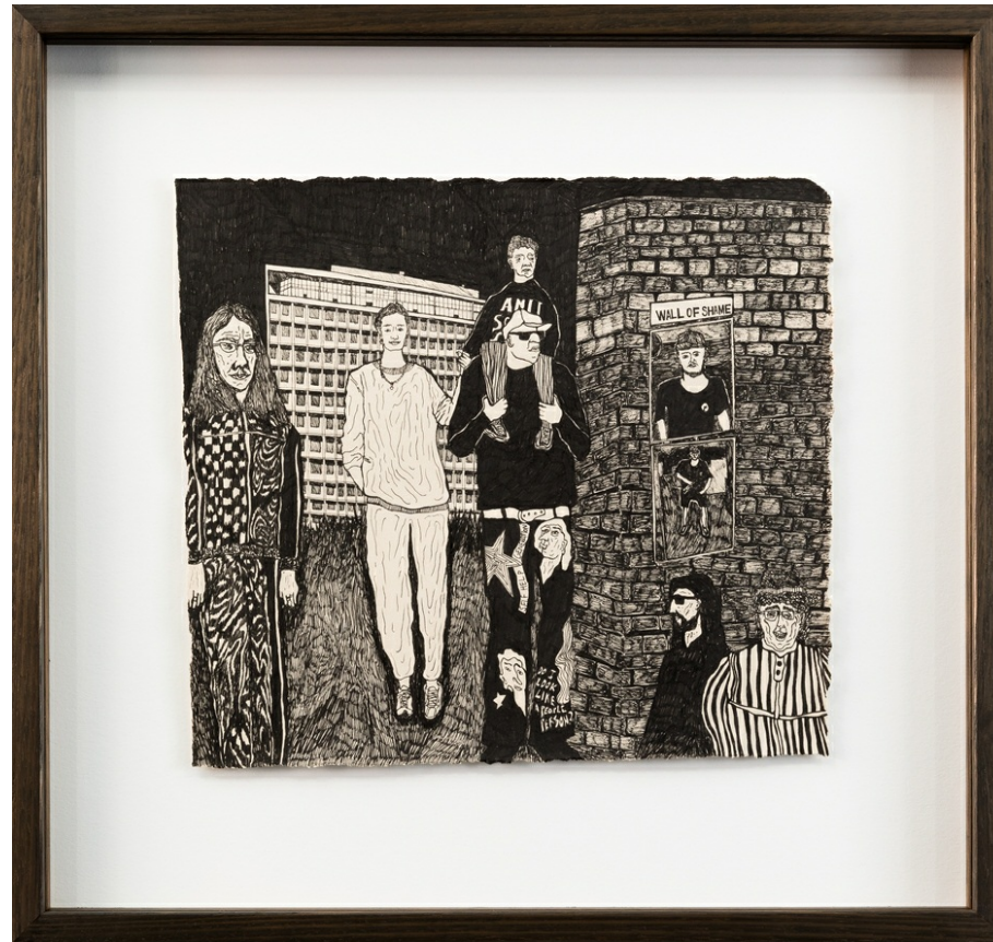
NICK SANTORO Wall of Shame, 2021 Pen and ink on paper 25 x 27 cm Framed: 41 x 43 cm AUD 2,200