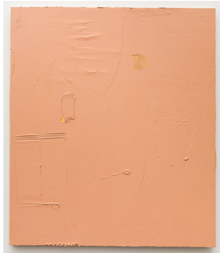
AARON FELL-FRACASSO I Think I'm Getting Gluten-Free Again oil and sand on board 110 x 95 cm AUD 3,200