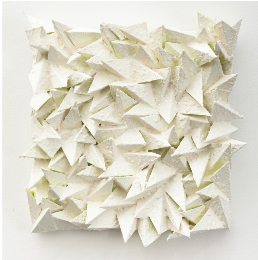
LEE BETHEL My Childish Plumes, 2020 oil, encaustic and watercolour on paper 36 x 36 cm AUD 1,200