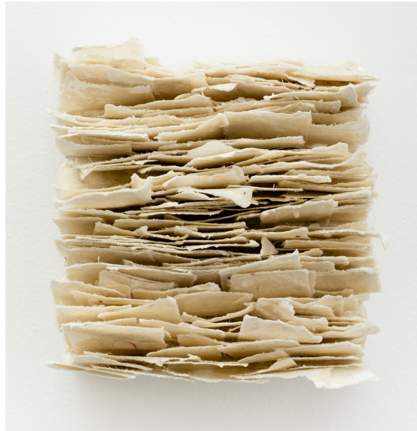
LEE BETHEL I Dwell in Possibility, 2020 natural wax on paper on board 15 x 15 cm AUD 750