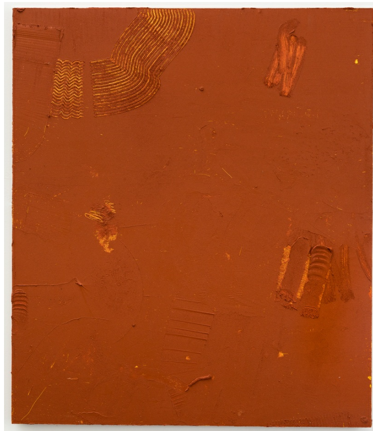
AARON FELL-FRACASSO Is 3 Minutes This Long or That Long?, 2020 oil and sand on board 110 x 95 cm AUD 3,200