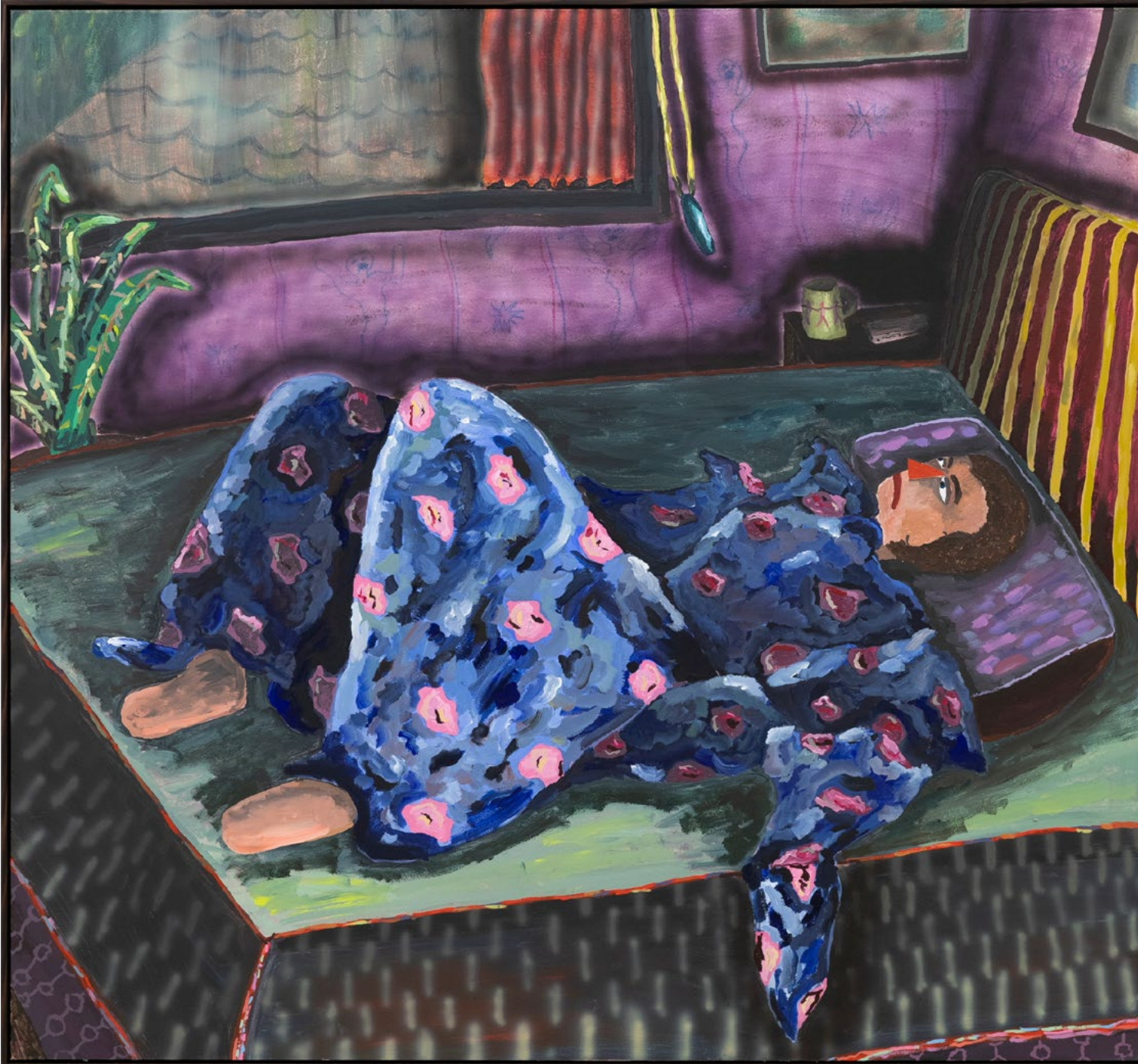
MARK MERRIKIN Nothing Imitates Anything We're Just Boaring And Repetitive, 2022 Acrylic, airbrush, coloured pencil on board 122 cm (h) x 130 cm (w) SOLD