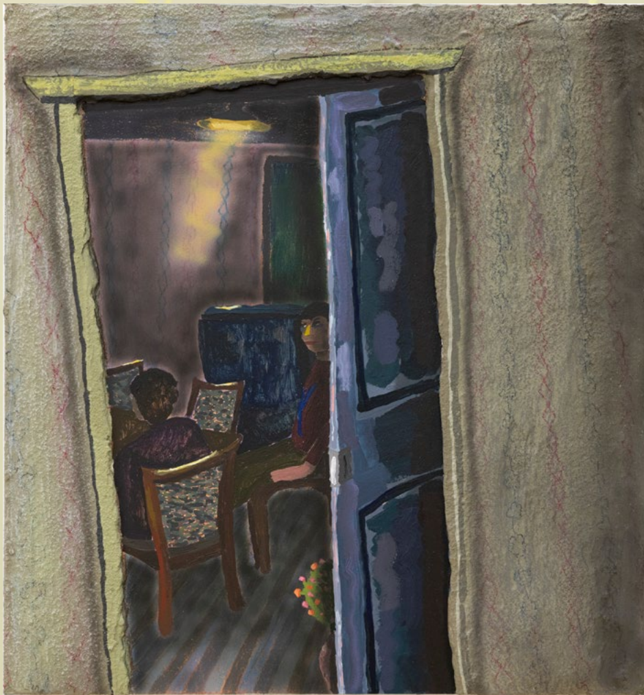
MARK MERRIKIN We're Having a Meeting About Breaving, 2022 Cement, acrylic coloured pencil on board 51.5 cm (h) x 48 cm (w) AUD 900