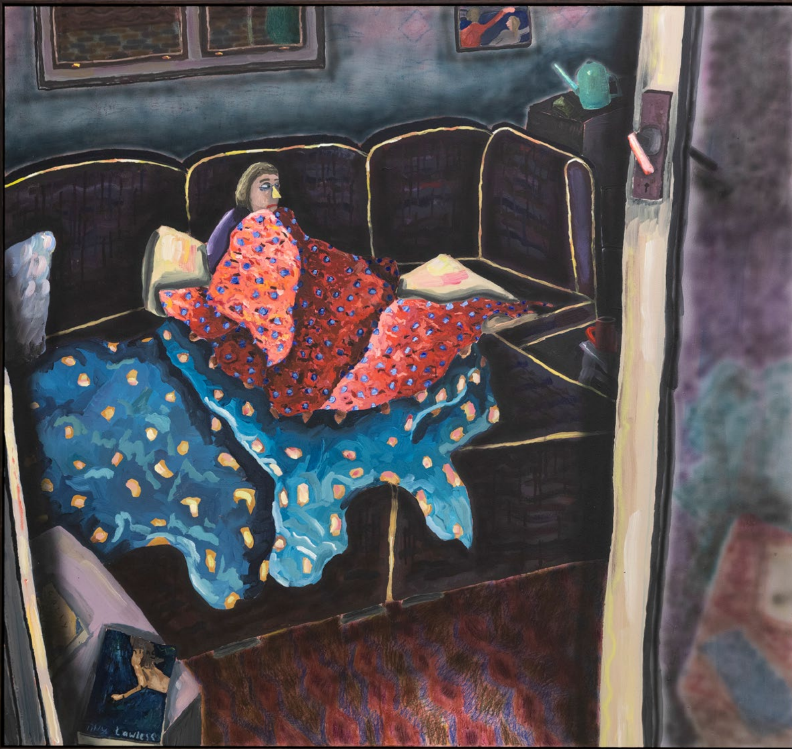
MARK MERRIKIN Night Imitates Anything We're Just Boaring And Repetitive, 2022 Acrylic, airbrush, coloured pencil on board 122 cm (h) x 130 cm (w) SOLD