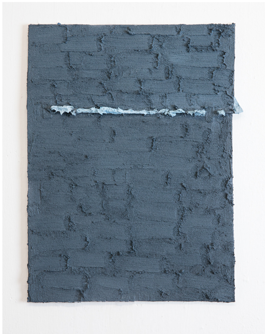
Louise Gresswell Untitled (grey) , 2019 Oil on board 36 x 28cm $1,750