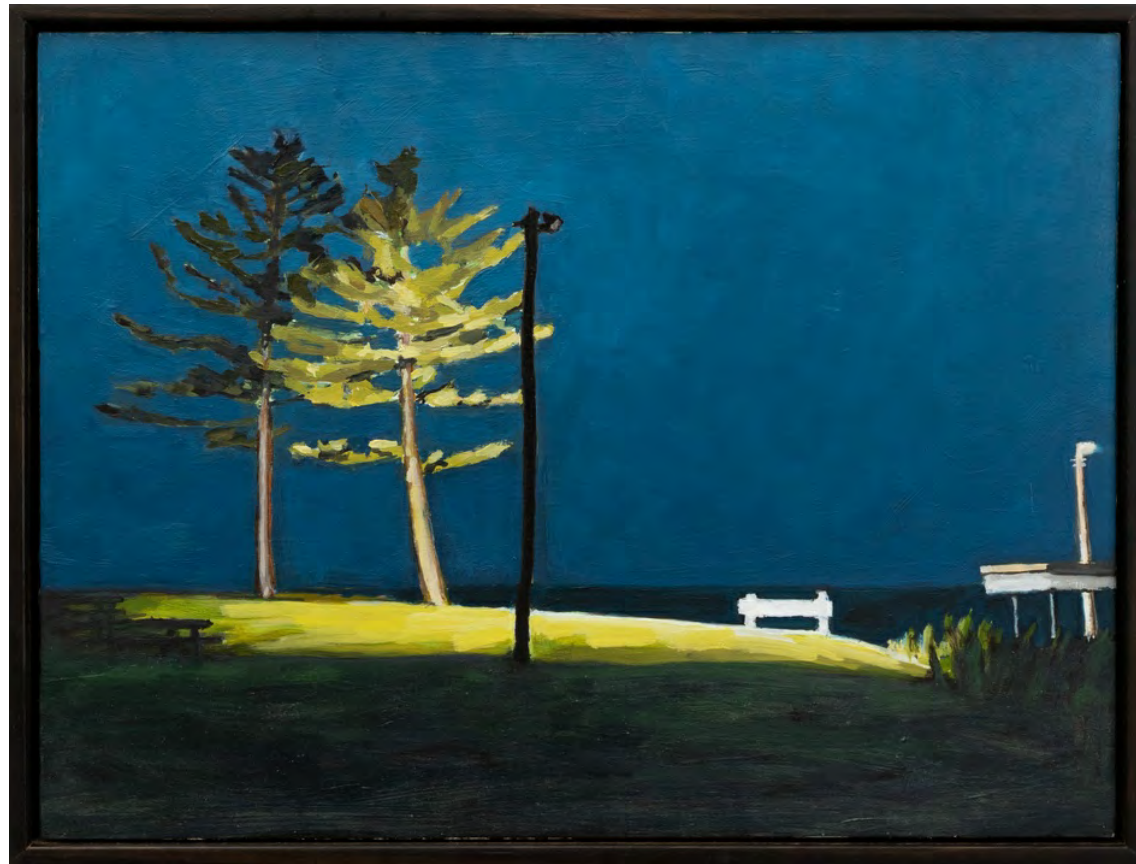
Lit , 2022 Oil on board, framed 28 x 37.5 cm AUD 1,850