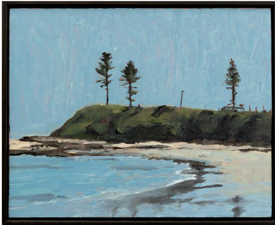
Headland (Waniora Point), 2022