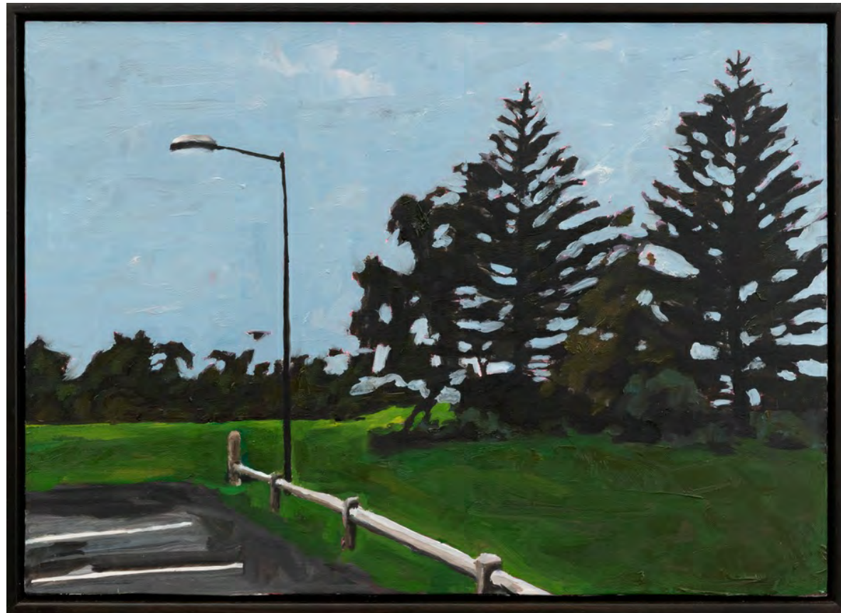
Point , 2021 Oil on board, framed 28 x 39.5 cm AUD 1,900