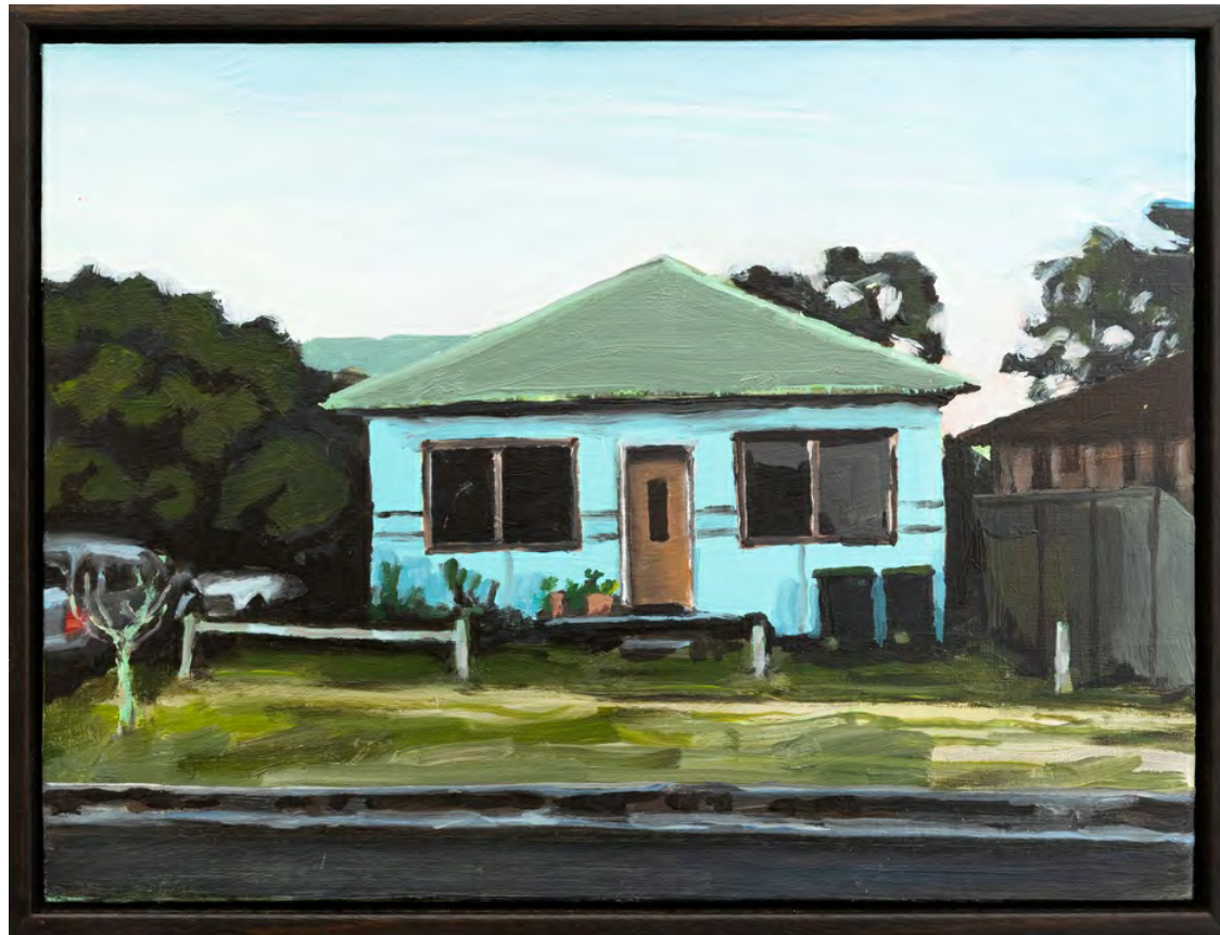
Turquoise House, 2022 Oil on board, framed 23 x 30 cm AUD 1,650