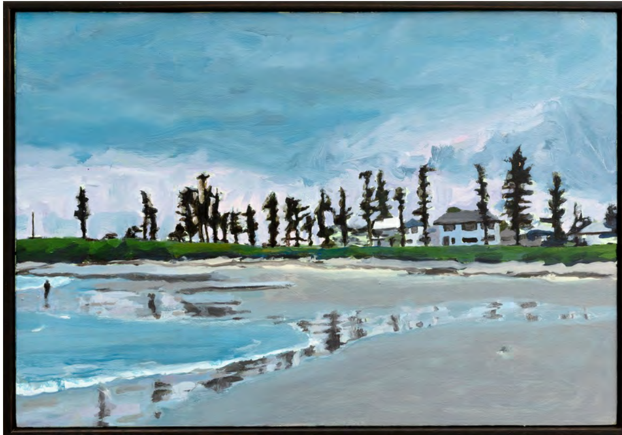
Bulli Point, 2022 Oil on board, framed 30 x 43.5 cm AUD 1,950