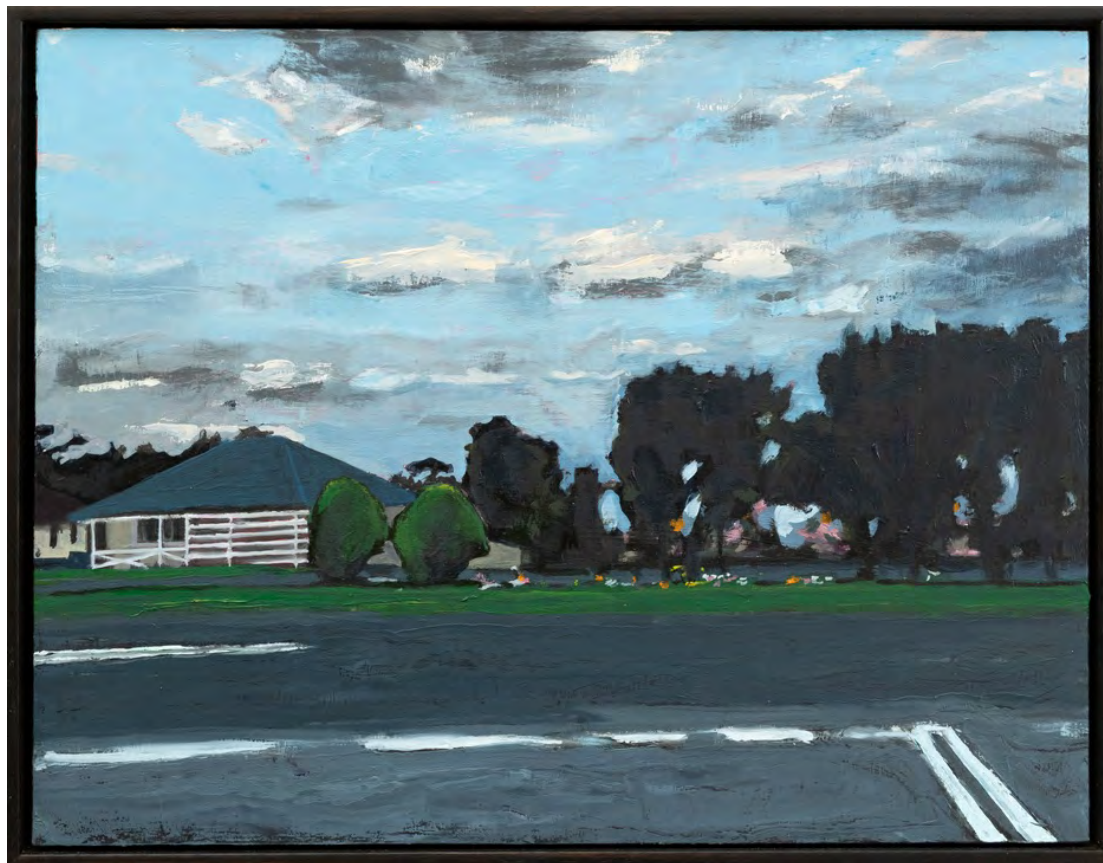
Cemetery, 2021 Oil on board, framed 30 x 39 cm AUD 1,900