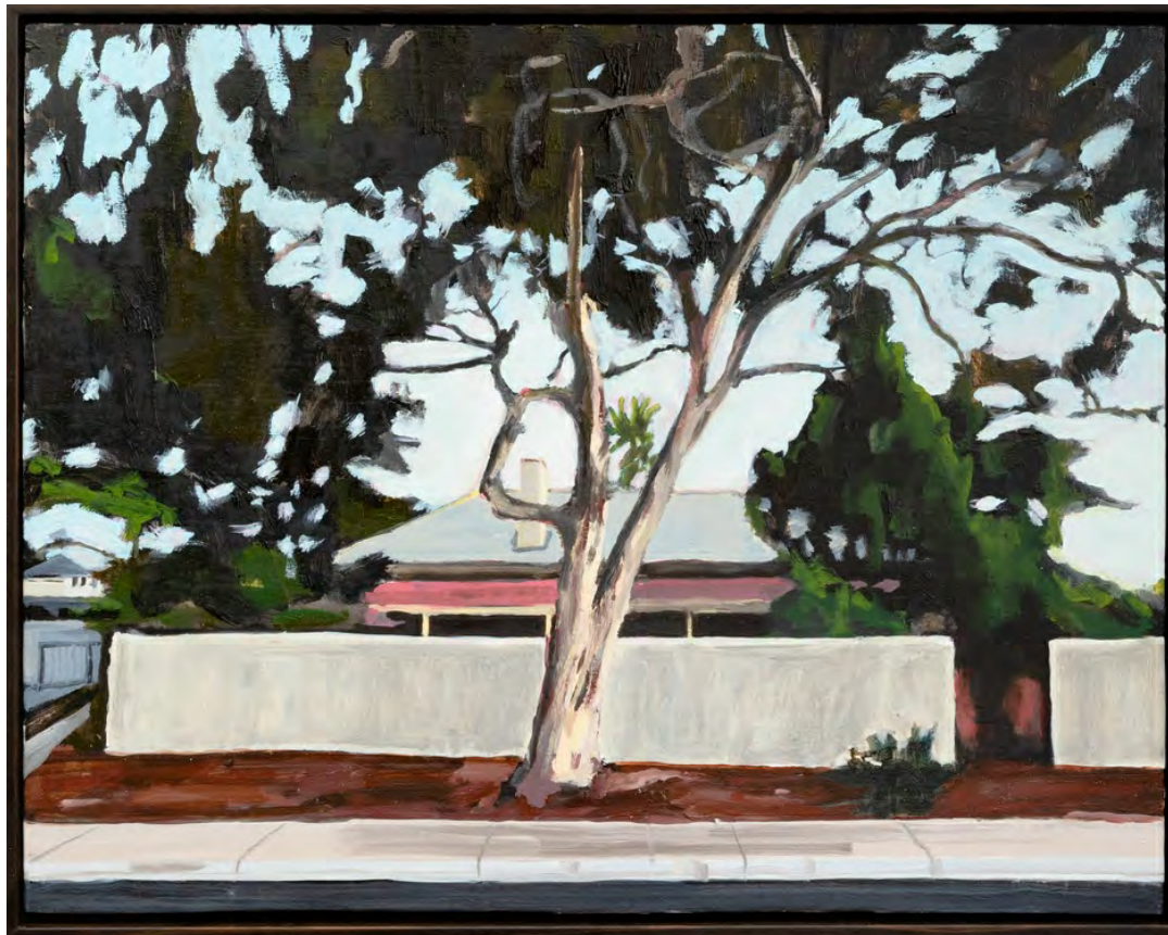
Marion Gum, 2021 Oil on board, framed 40.5 x 52 cm AUD 2,650