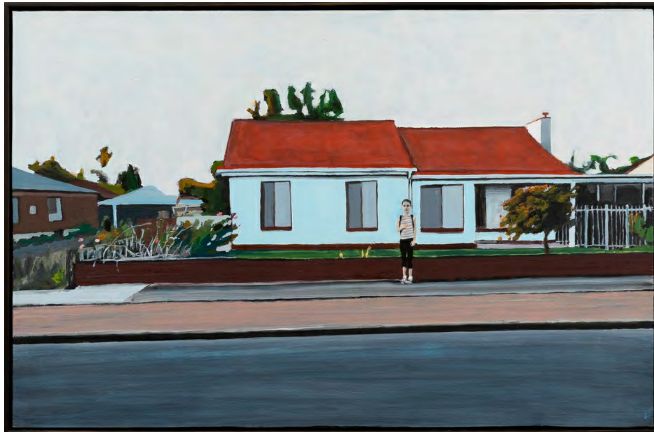
Marion , 2021 Oil on board, framed 52 x 80 cm AUD 4,100