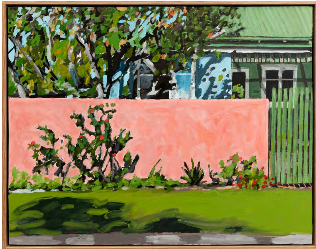
Wall , 2021 Oil on board, framed 41 x 52 cm AUD 2,650