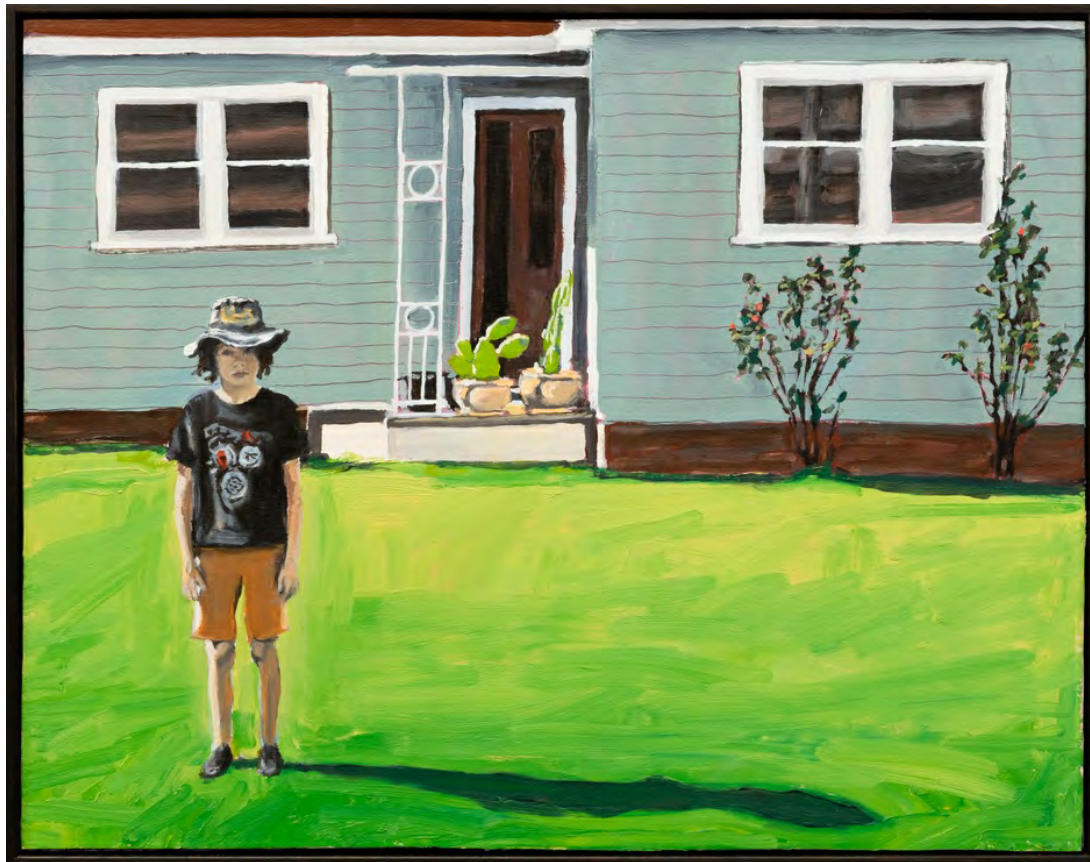
Payne Road , 2021 Oil on board, framed 40.5 x 52 cm AUD 2,650