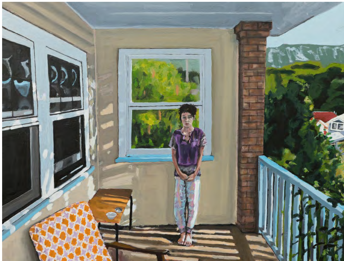
Front Balcony (morning), 2020