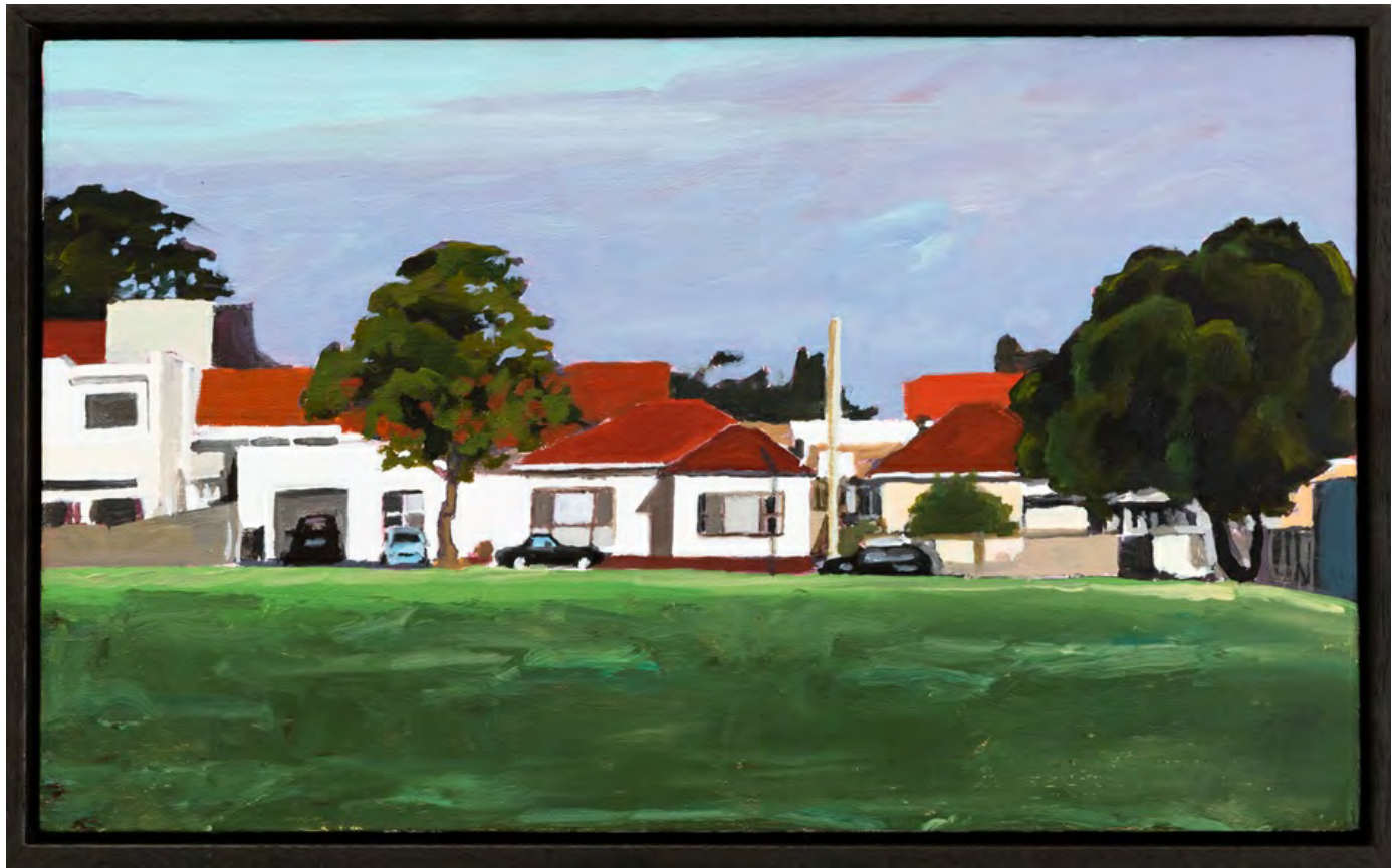
Guest Park, 2021 Oil on board, framed 21.5 x 25.5 cm AUD 1,650