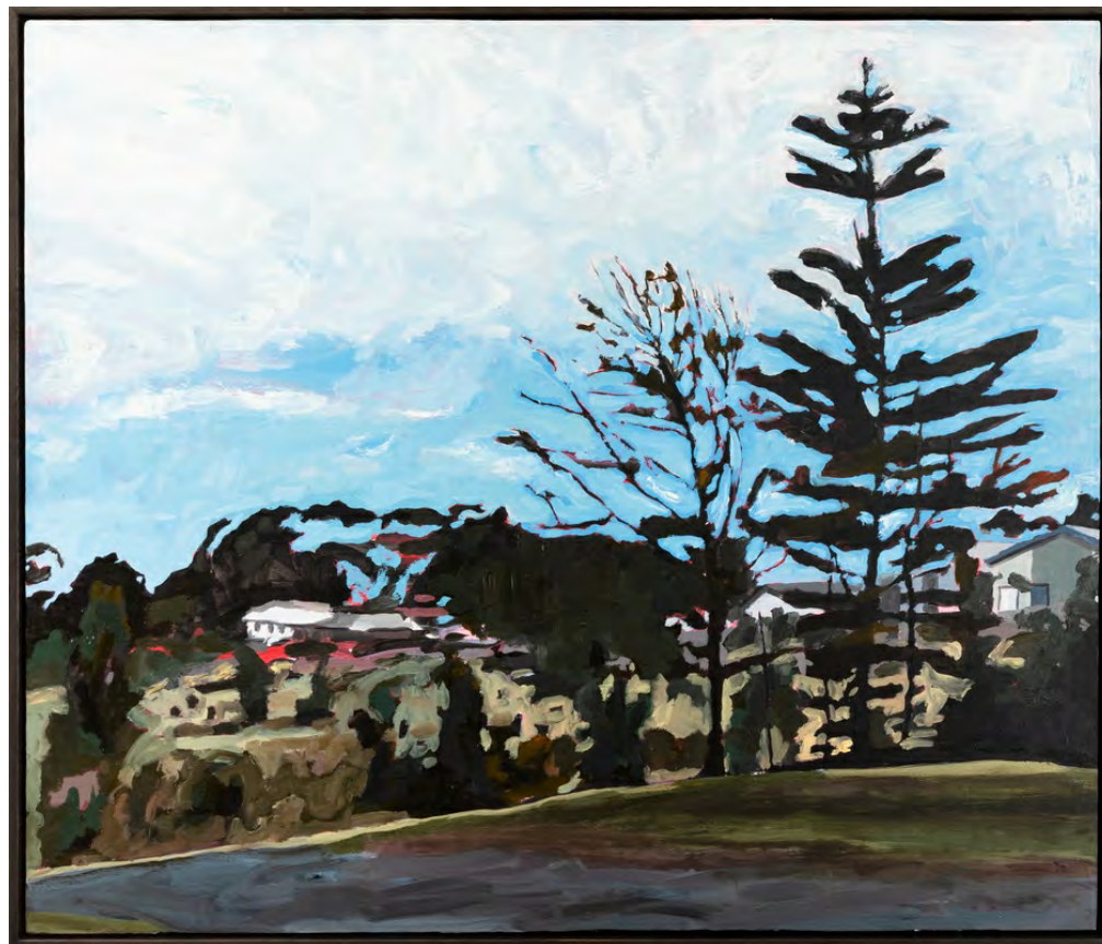
Bulli Brickworks , 2021 Oil on board 61 x 72 cm AUD 3,650