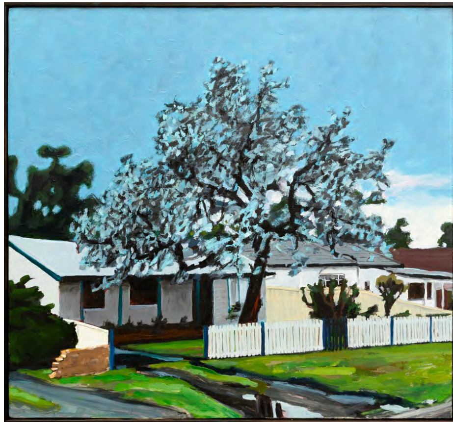
Corrimal Iron Bark , 2022 Oil on board, framed 50 x 54 cm AUD 2,950