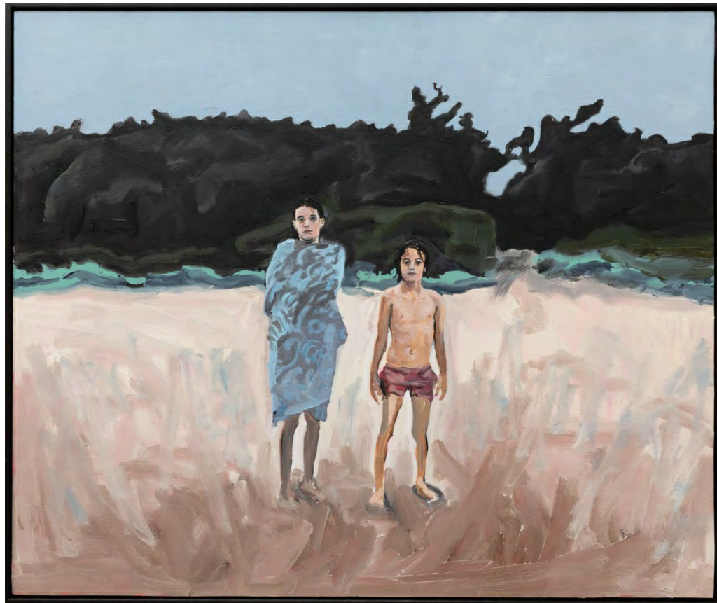
Late Swim , 2022 Oil on board, framed 61 x 73.5 cm AUD 3,950