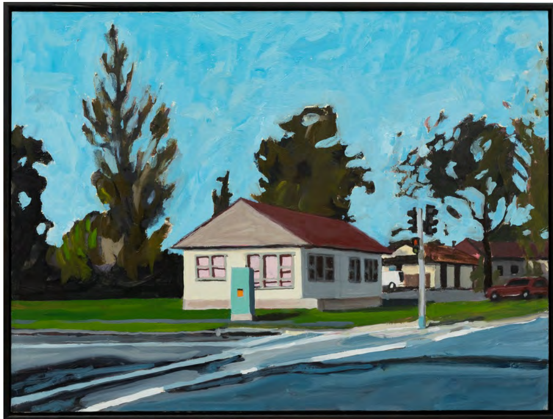
Traffic Signal Box, 2021 Oil on board, framed 40.5 x 54 cm AUD 2,650