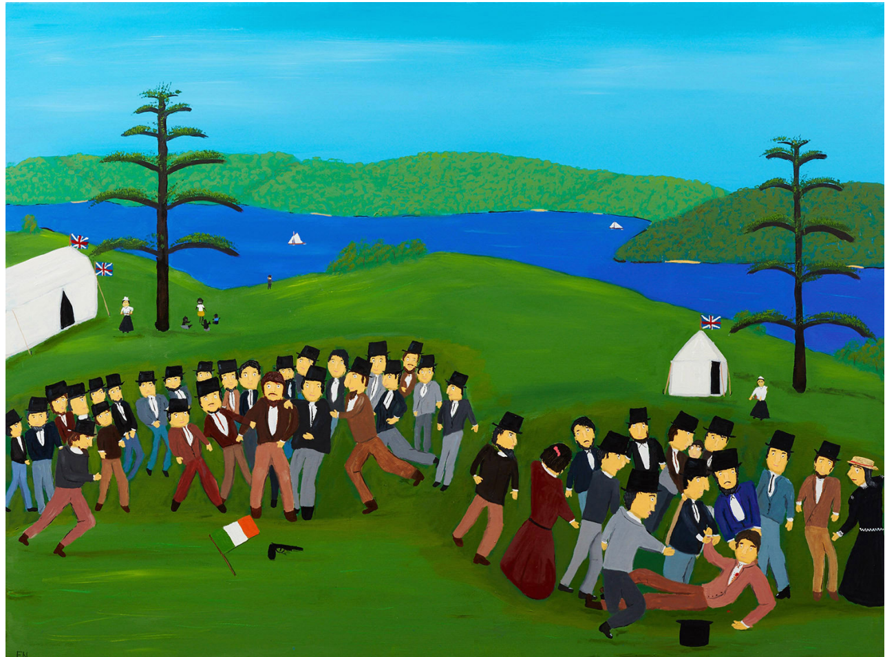
The Attempt on Prince Alfred 2019, oil on canvas 76 x 102 cm $4,500