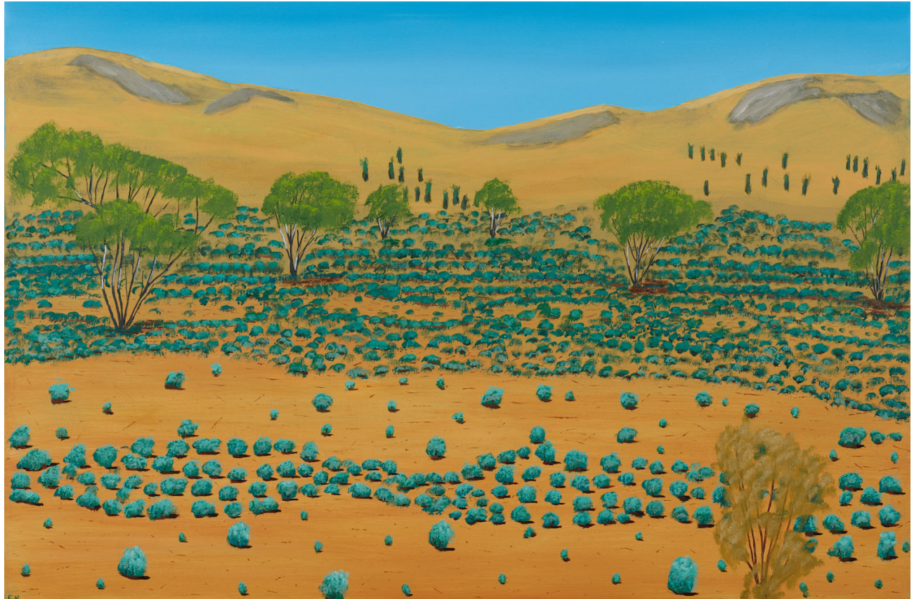
Approaching the Plain 2019, oil on canvas 51 x 76 cm $3,200