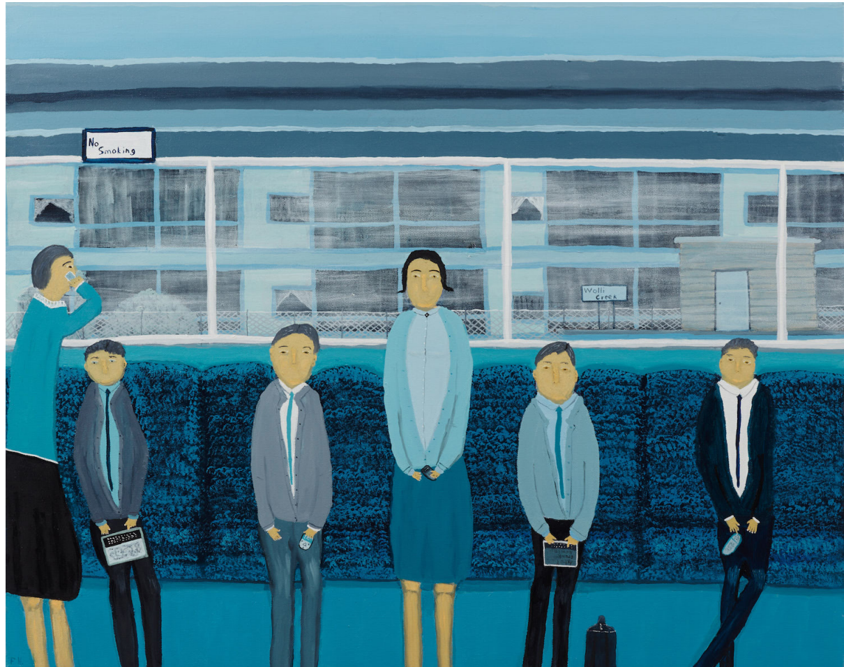
Five O'clock at Wollie Creek after Brack 2019, oil on canvas 61 x 76 cm $3,600 (SOLD)