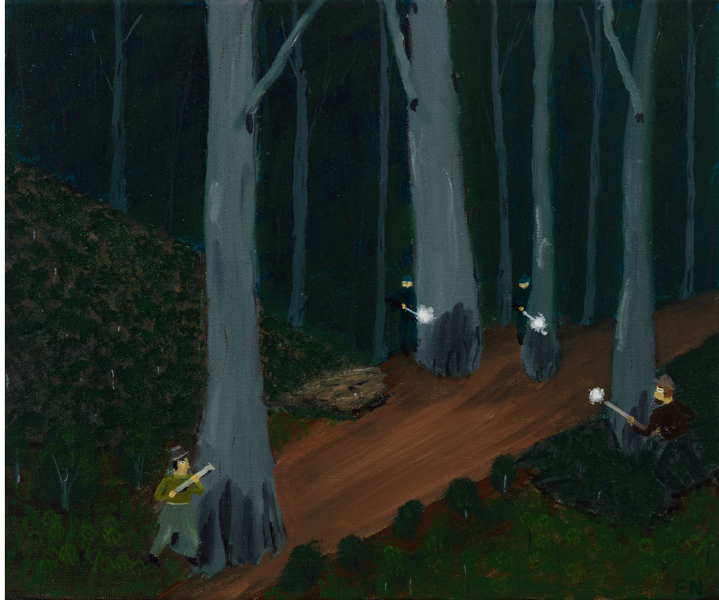
The Shoot Out 2019, oil on canvas 26 x 30.5 cm $1,000