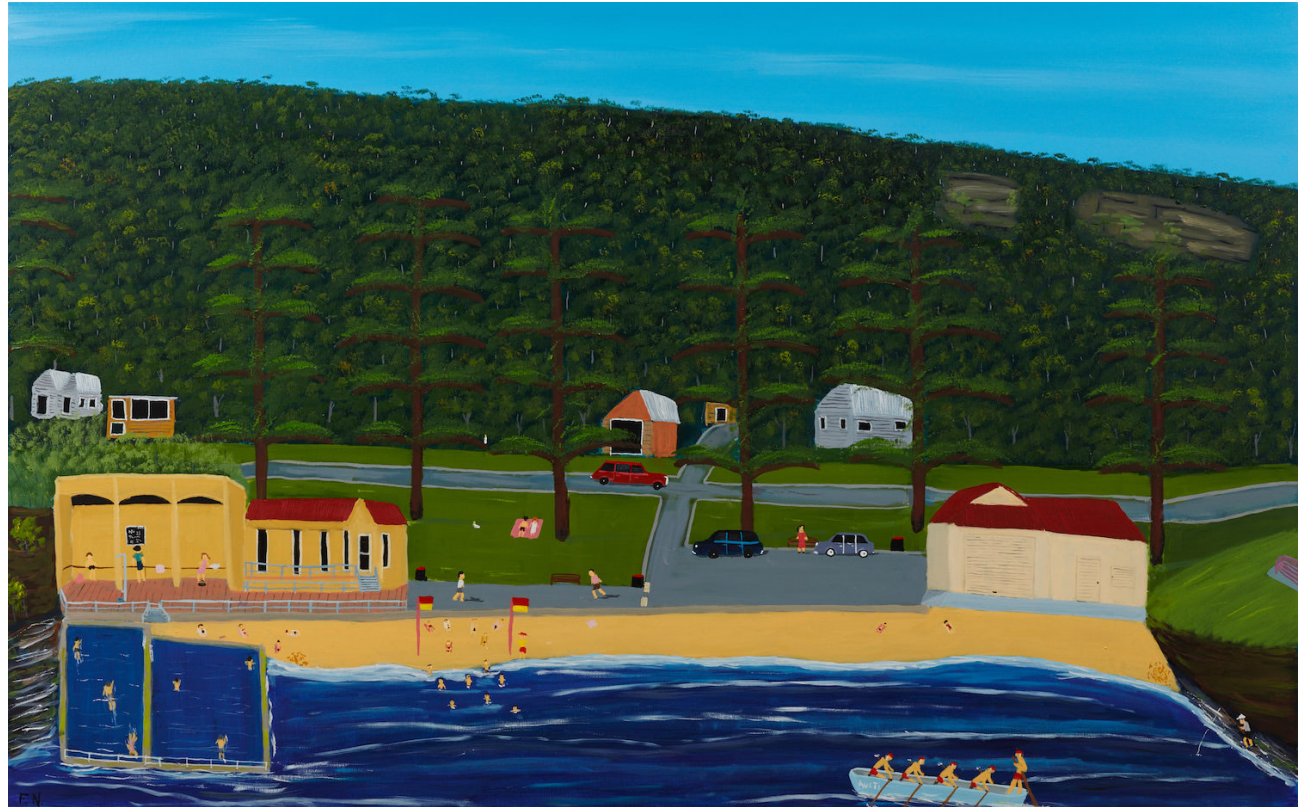
At Austi 2019, oil on canvas 76 x 121.5 cm $5,500