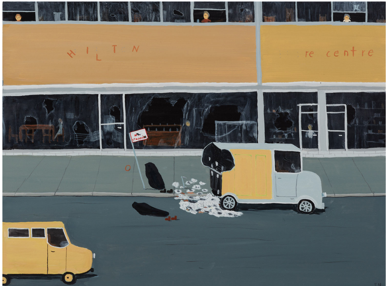
The Attempt on The Hilton 2019, oil on canvas 46 x 61 cm $2,800