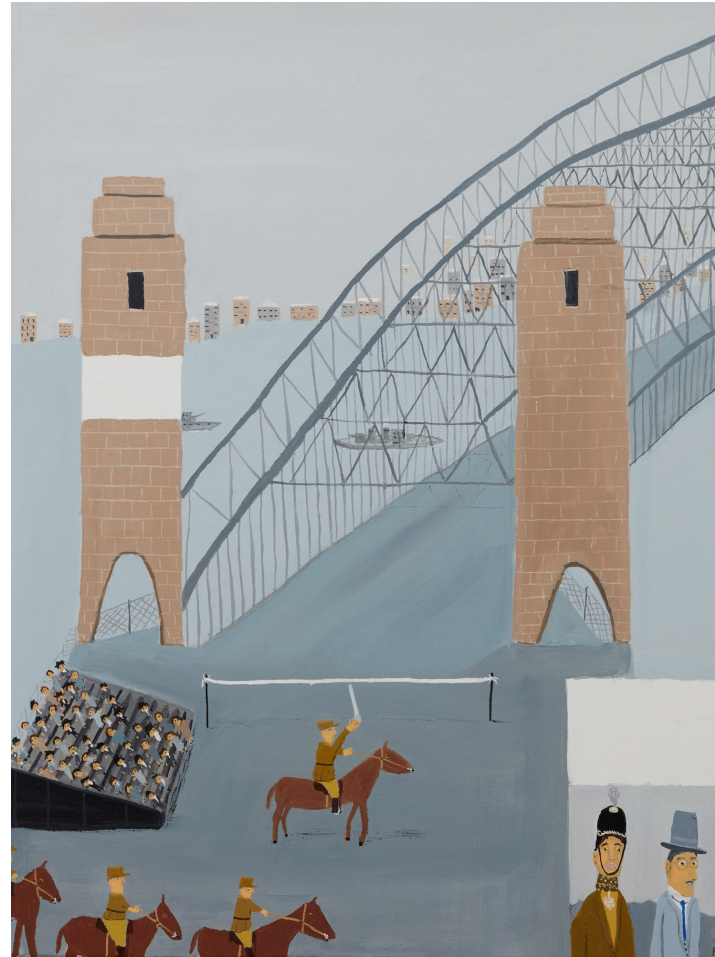
Frances de Groot Attempt 2019, oil on canvas 61 x 46 cm $2,800 (SOLD)