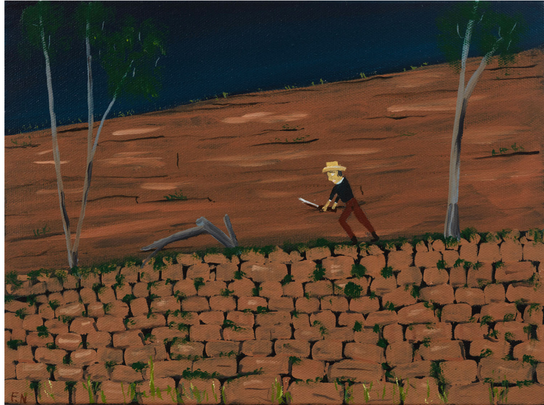
Wolloo Jack on the Wodi-Wodi Track 2019, oil on canvas 23 x 30.5 cm $1,000