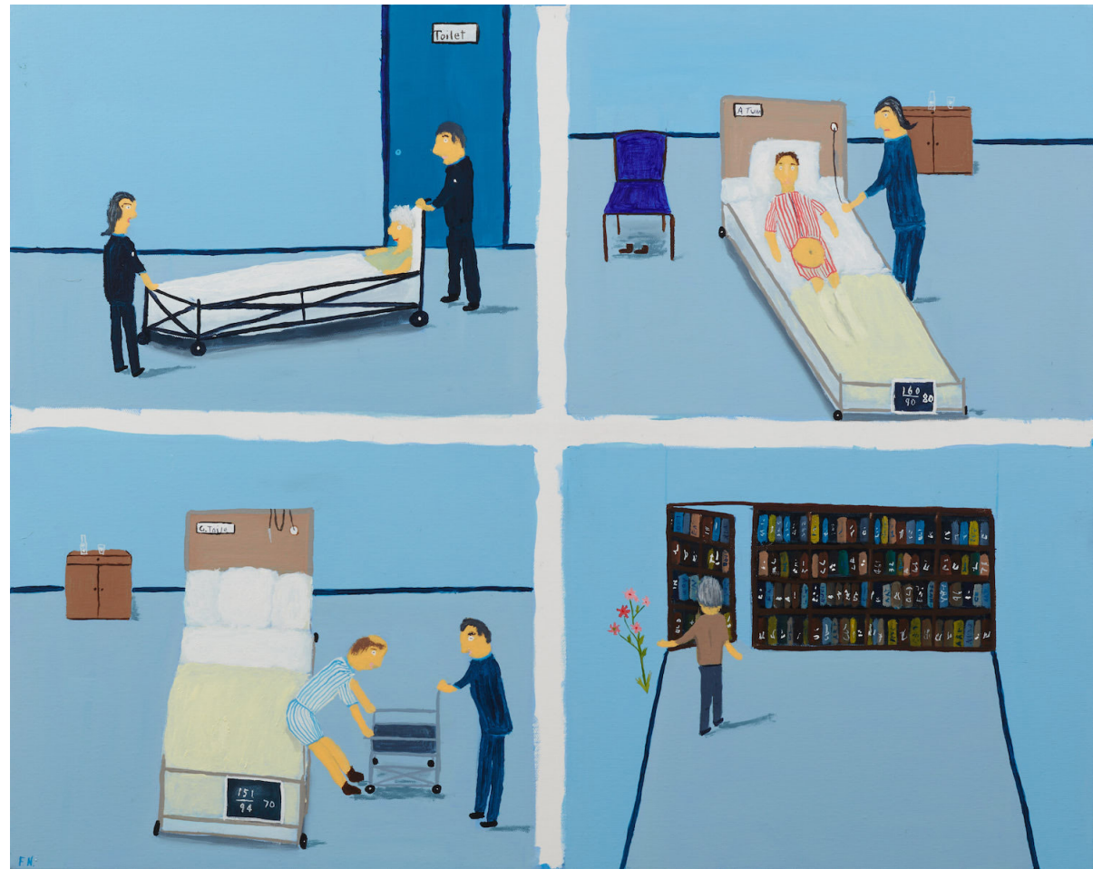
The Dementia Ward 2019, oil on canvas 61 x 76 cm $3,600