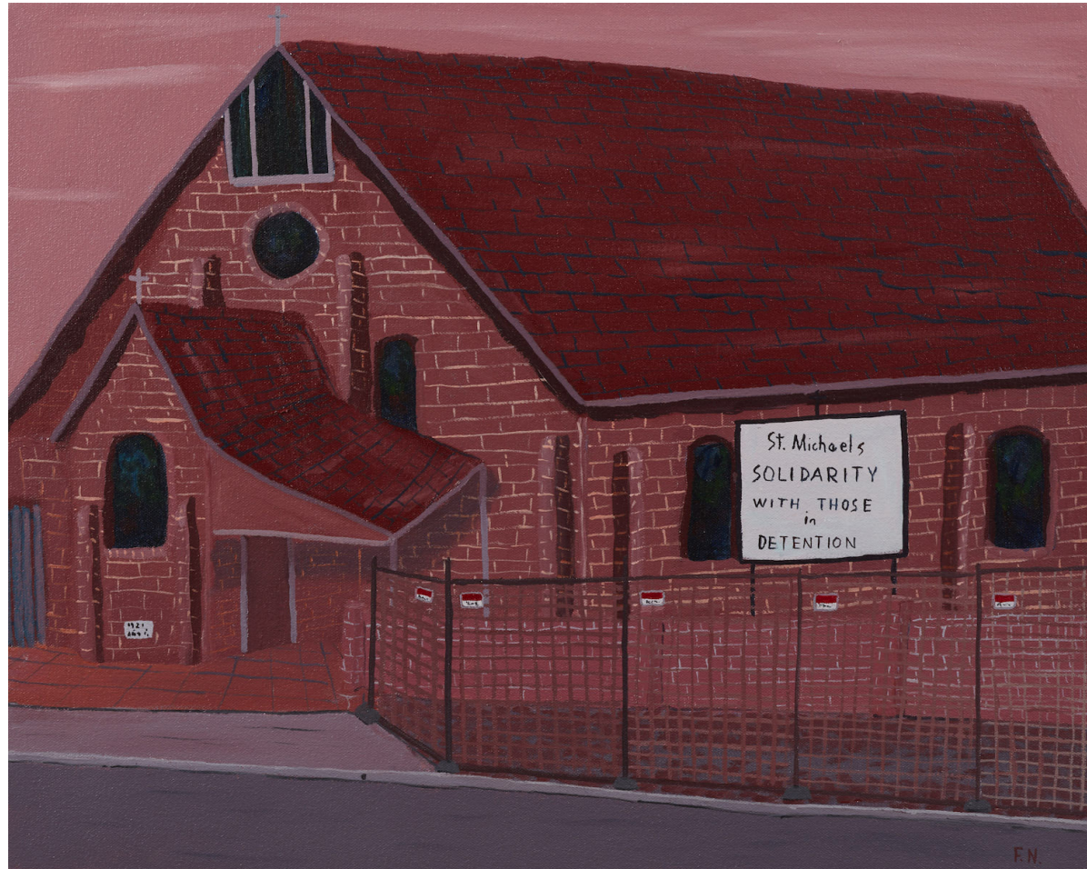
Solidarity with those in Detention 2018, oil on canvas 40 x 50 cm $2,000