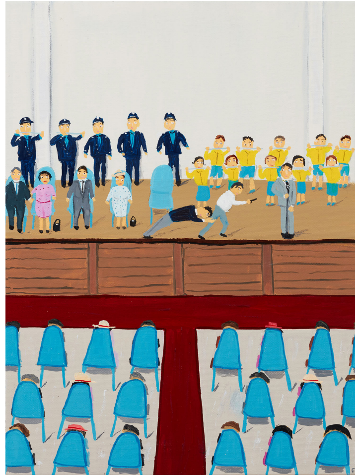
The Attempt on Prince Charles 2020, oil on canvas 40.5 x 30 cm $1,500