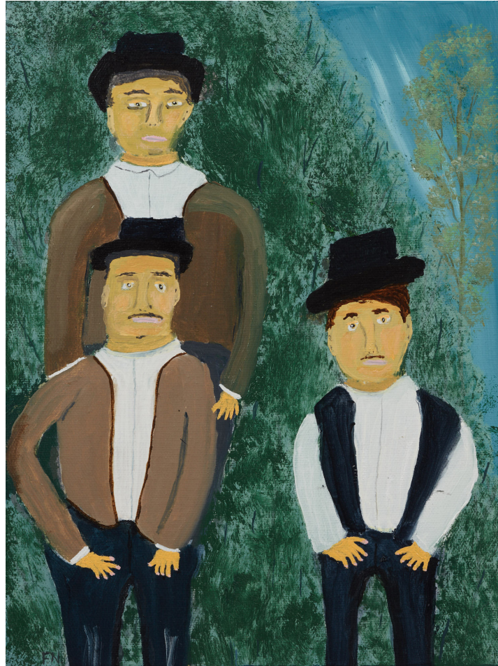
Wolloo Jack Gang 2019, oil on canvas 30.5 x 23 cm $1,000 (SOLD)