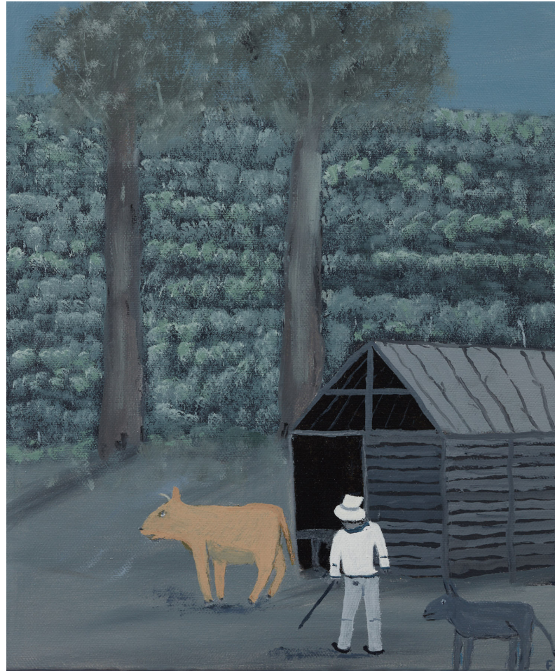
Little Bulli Cattle Duffer 2019, oil on canvas 30.5 x 26 cm $1,000 (SOLD)