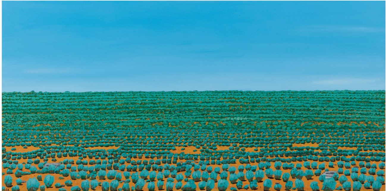
On the Plain 2019, oil on canvas 50.5 x 101.5 cm $3,600