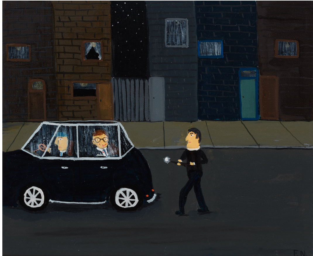
The Attempt on Caldwell 2020, oil on canvas 25 x 30.5 cm $1,000