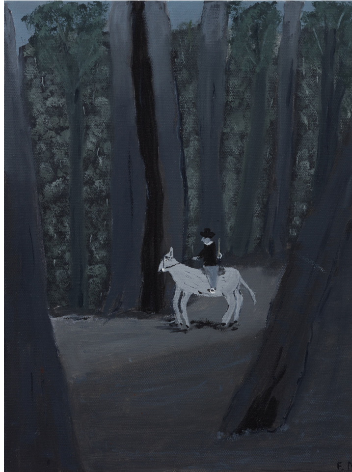
Lone Illawarra Bushranger 2019, oil on canvas 30.3 x 23 cm $1,000