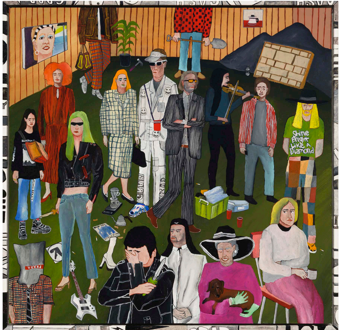
At the Backyard Gig When the Post Punk was Sad, 2020, acrylic on board with handpainted timber frame, 52 x 52 cm SOLD