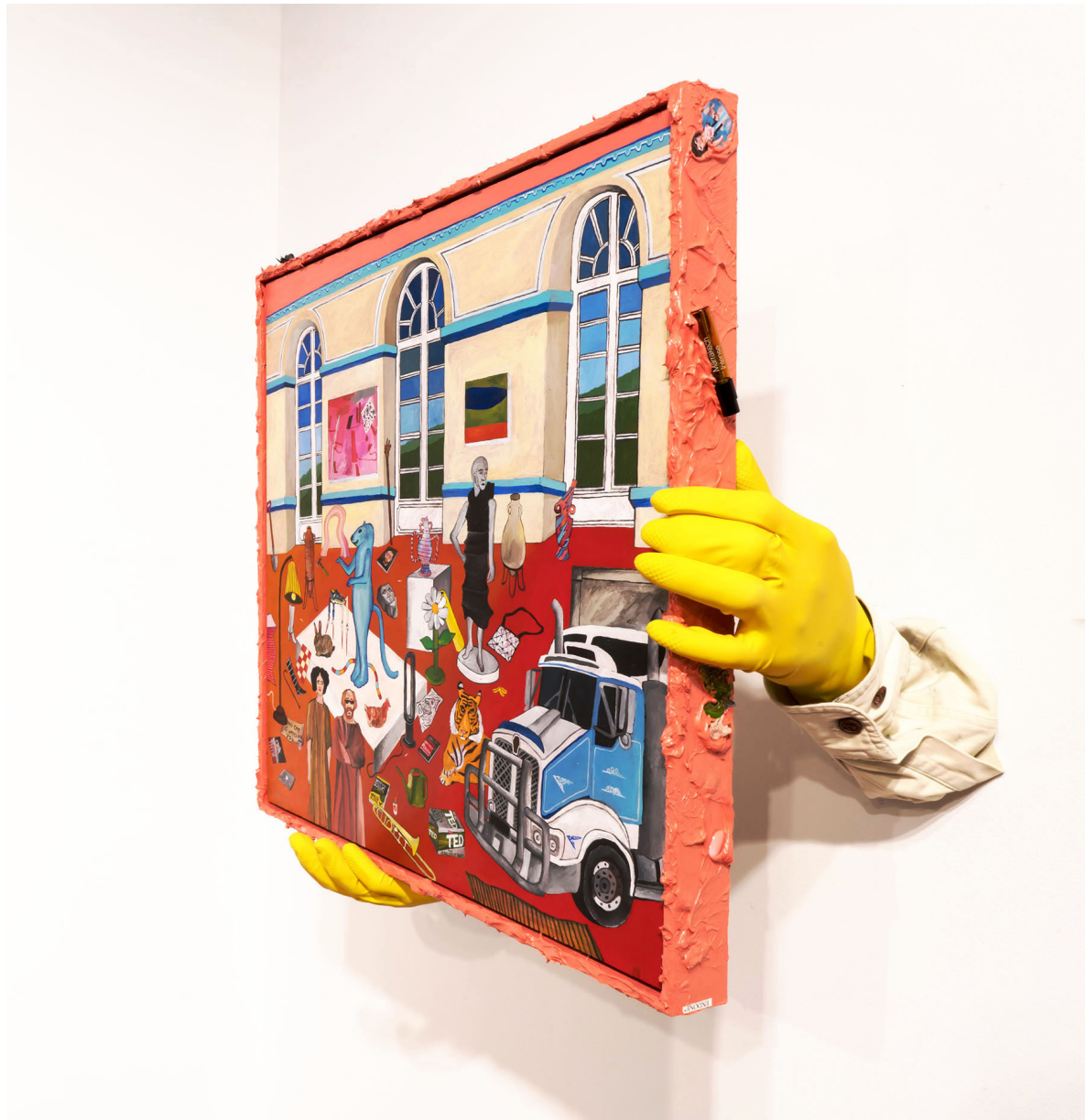
Our House if/when We're Art Collectors, 2020, acrylic on board with handpainted timber frame, headphones, SIM card, Aesop perfume sample, plastic goblin, photograph, Endone packet and dried acrylic paint, 52 x 52 cm SOLD