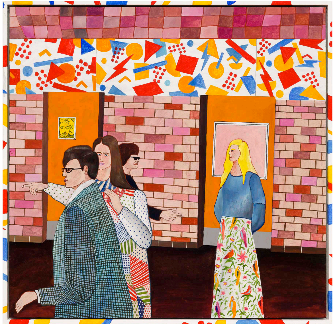
It's Summer, 2020, acrylic on board with handpainted timber frame, 52 x 52 cm SOLD