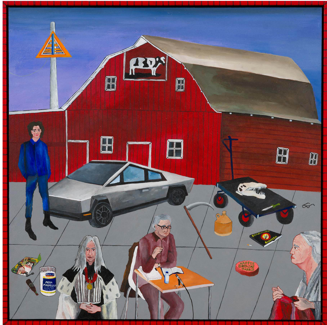
MEGA MAGNESIUM, 2020, acrylic on board with handpainted timber frame, 52 x 52 cm SOLD