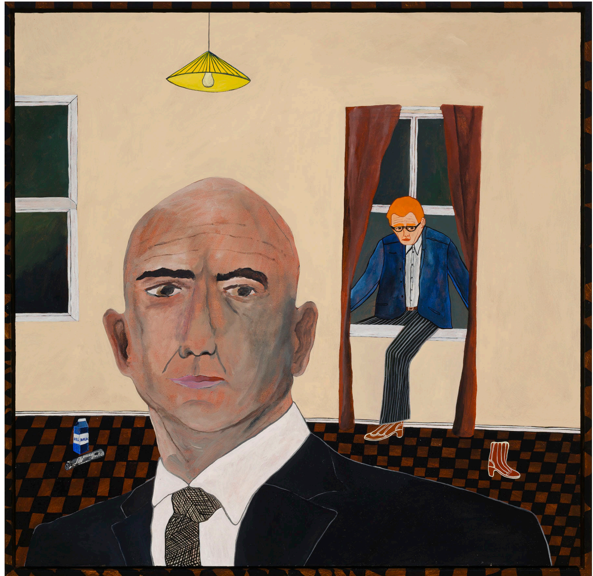
Bezos, 2020, acrylic on board with handpainted timber frame, 52 x 52 cm