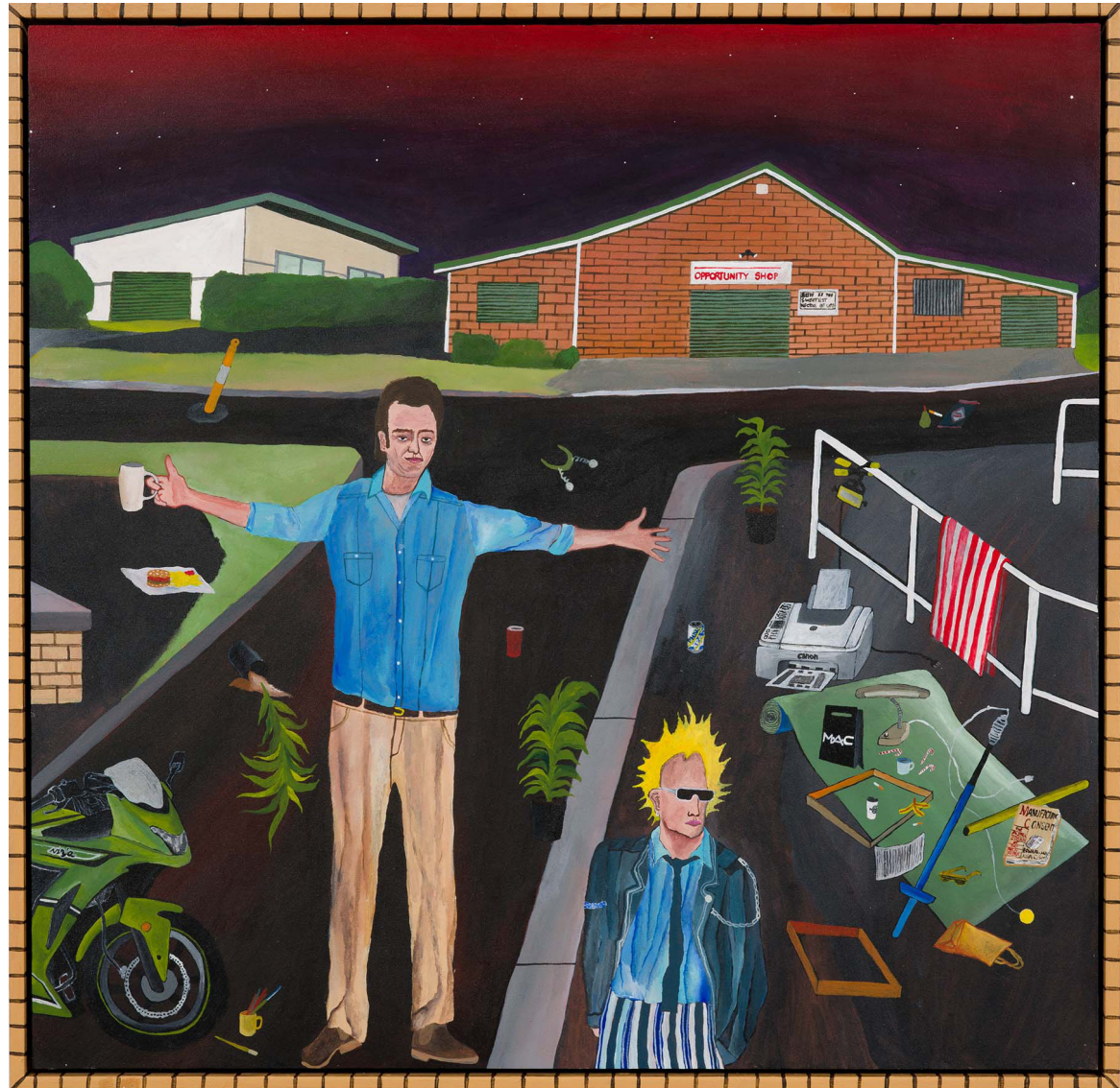
Come Back To Me My Sweet Punk, 2020, acrylic on board with handpainted timber frame, 52 x 52 cm SOLD