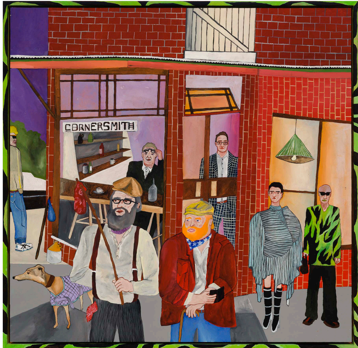
Cornersmith Montage, 2020, acrylic on board with handpainted timber frame, 52 x 52 cm SOLD