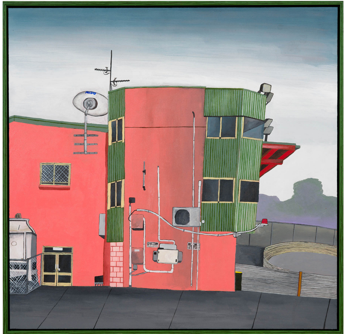
Slacky Flat, 2020, acrylic on board with handpainted timber frame, 52 x 52 cm SOLD