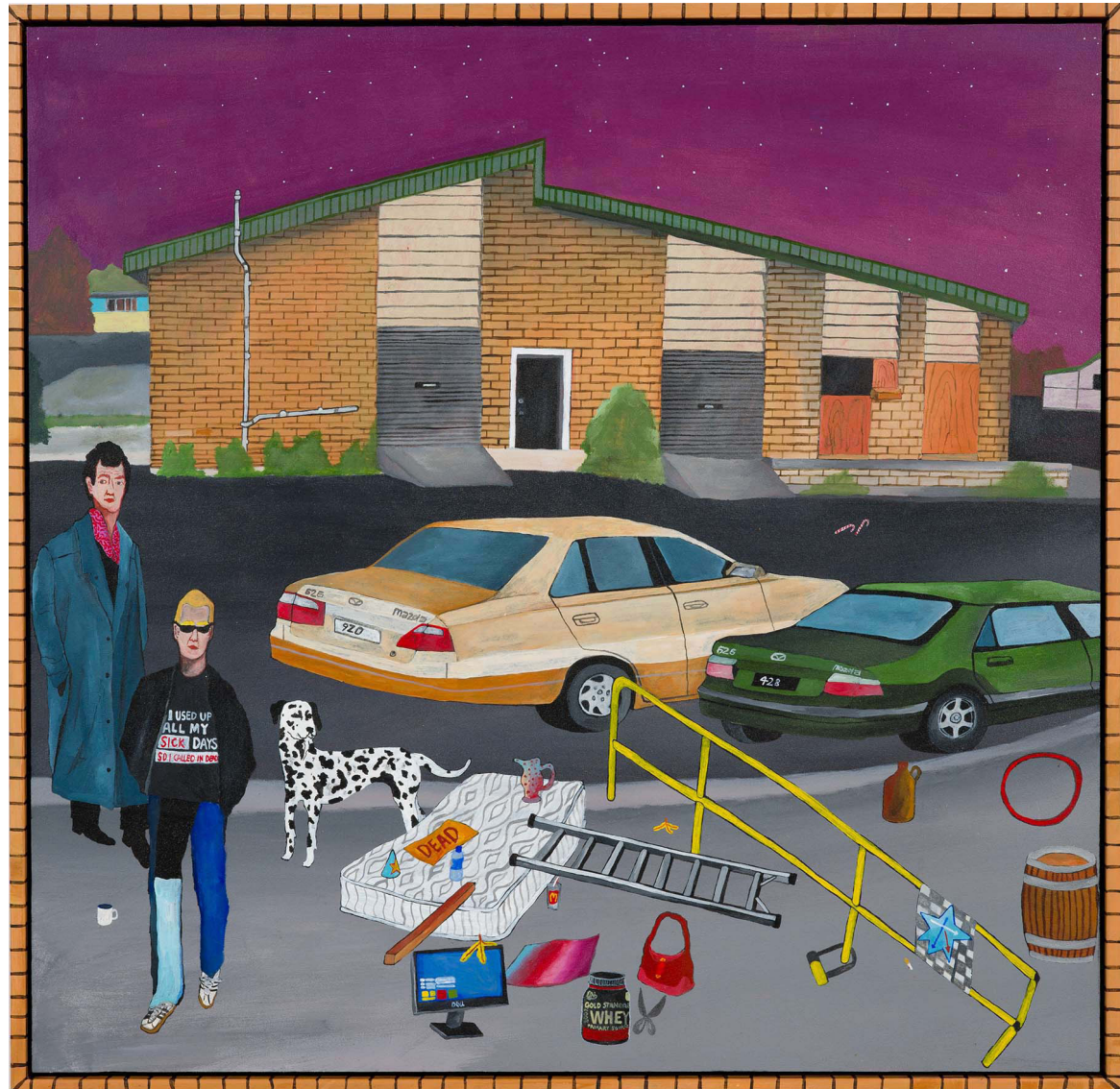
Culburra 626, 2020, acrylic on board with handpainted timber frame, 52 x 52 cm SOLD