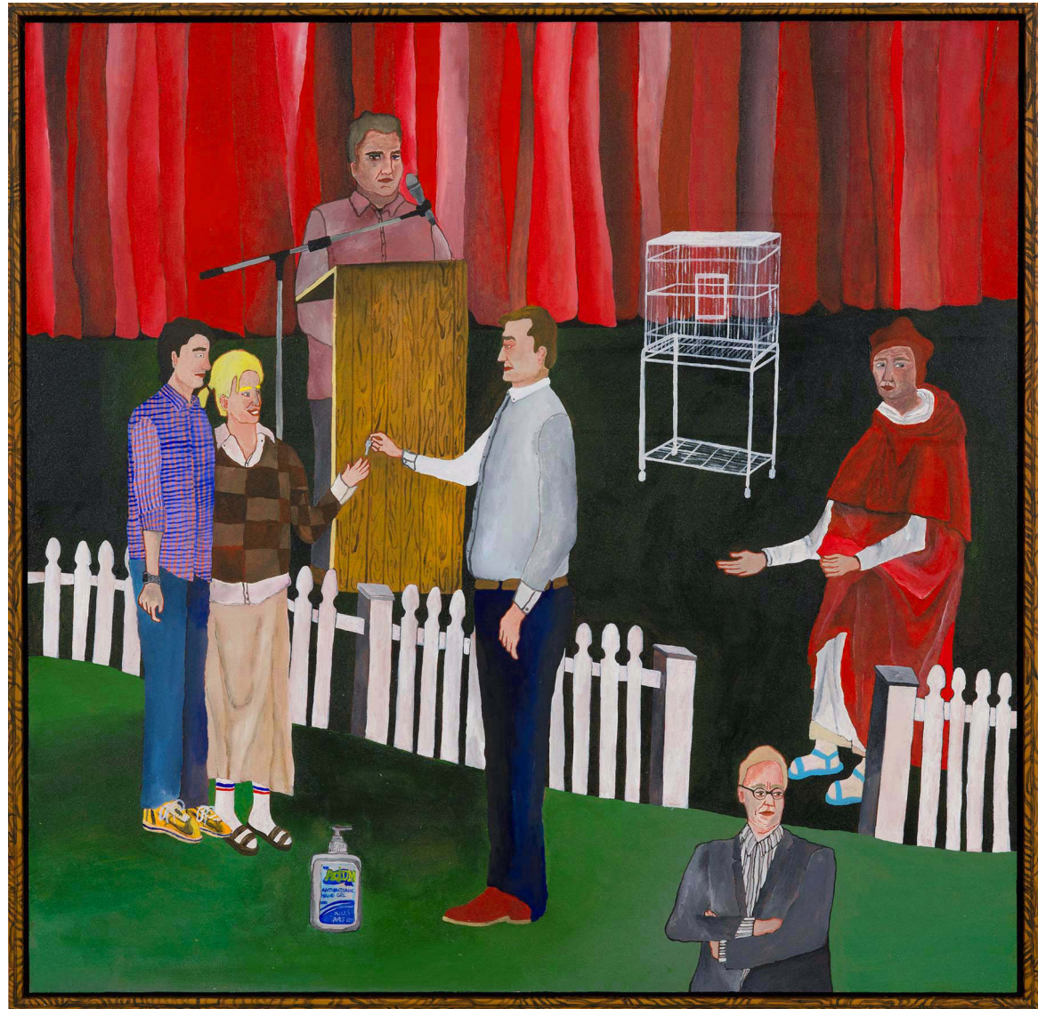
AQIUM , 2020, acrylic on board with handpainted timber frame, 52 x 52 cm